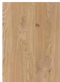
320 Honey Ash Oak