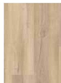
730 River Bed Oak