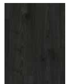
790 Wayward Oak