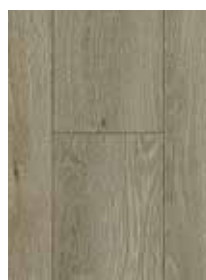
560 Grove Oak