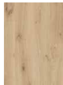
510 Mornington Oak