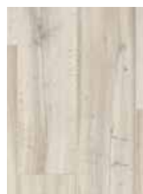
700 Summit Oak