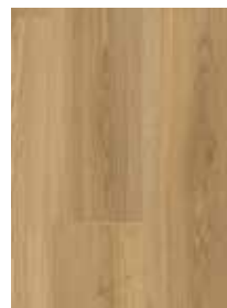
350 Harvest Oak