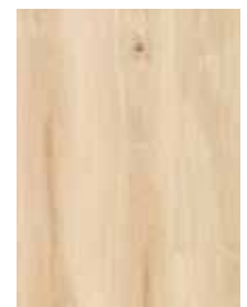
520 Natural Oak