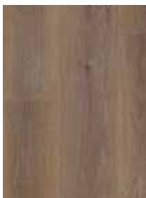
170 Russet Oak