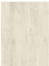
110 Whitewash Oak