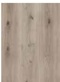
550 Tawny Oak